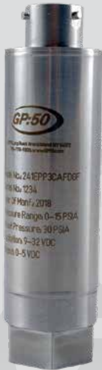
Model 241 / 341 High-Accuracy Pressure Transducer