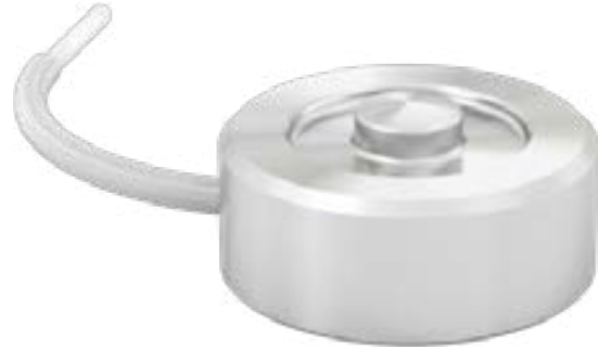
Model LBM-5K (Shown)